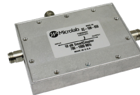
SMART Coupler Narrowband

Microlab's SMART (System Monitor Alarm Report Technology) Passives System enables real-time performance monitoring of a Public Safety DAS structured cabling, RF components, and antennas deep into a building. The SMART Passives System is made up of a SMART Gateway and SMART Couplers. The SMART Coupler was designed to replace common passive DAS tap or coupler values. A building's DAS network of SMART Coupler nodes is complemented by a SMART Gateway at the head-end's main RF source.